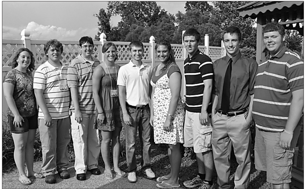
2010 UDWI Scholarship recipients pose for a photo during the recognition program.